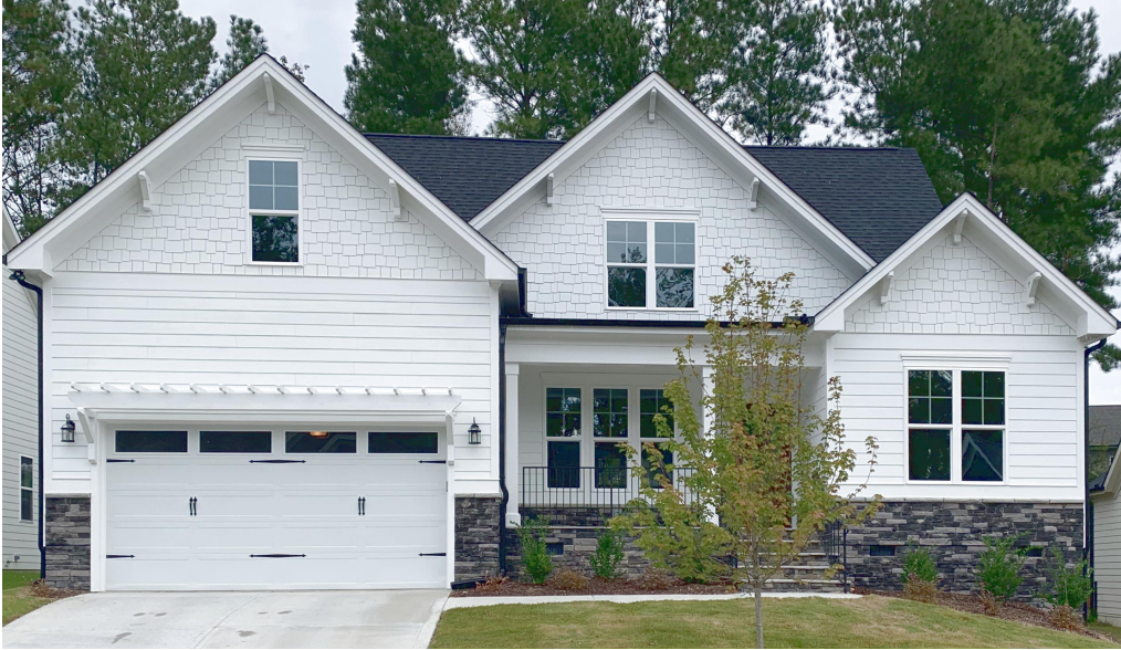
***This photo is a rendition of the home to be built.***